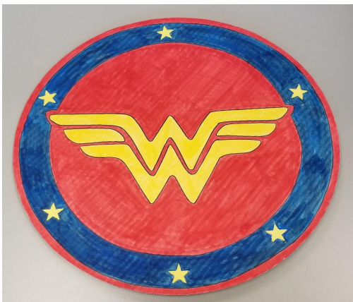
Front of shield